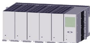
P/N 030-706-20 L0 (Center Mount) Cordex 5kW Bulk Power with plug in controller