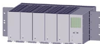
P/N 030-706-20 L0 Shown with 23" bracket (Center Mount) Cordex 5kW Bulk Power with plug in controller