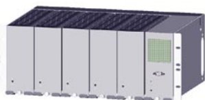
P/N 030-707-20 L0 (Flush Mount) Cordex 5kW Bulk Power System with plug in controller