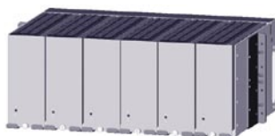
P/N 030-706-20 L81 (Center Mount) Cordex 6kW Bulk Power shelf