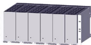
P/N 030-707-20 L81 (Flush Mount) Cordex 6kW Bulk Power System