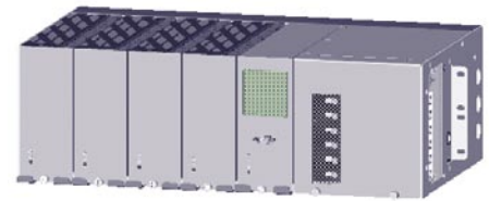
Cordex 4kW Shelf Power System (P/N 030-704-20 L0)