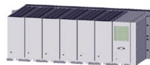
P/N 030-711-20 L0 (Flush/Center Mount) Cordex 6kW Bulk Power System with plug in controller